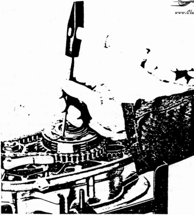
Fig. 3 Bend down the raised corners of the spacer washer.