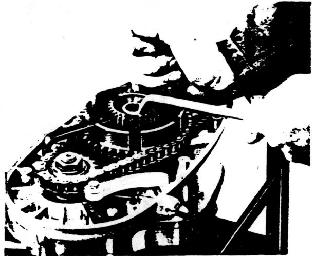
Fig. 5 Insert locking plate and unscrew nut on gearbox mainshaft.