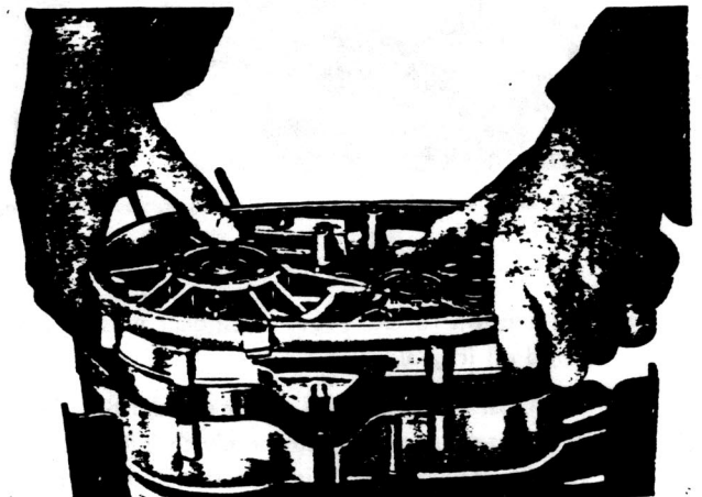
Fig. 6 Take off left-hand crankcase cover.